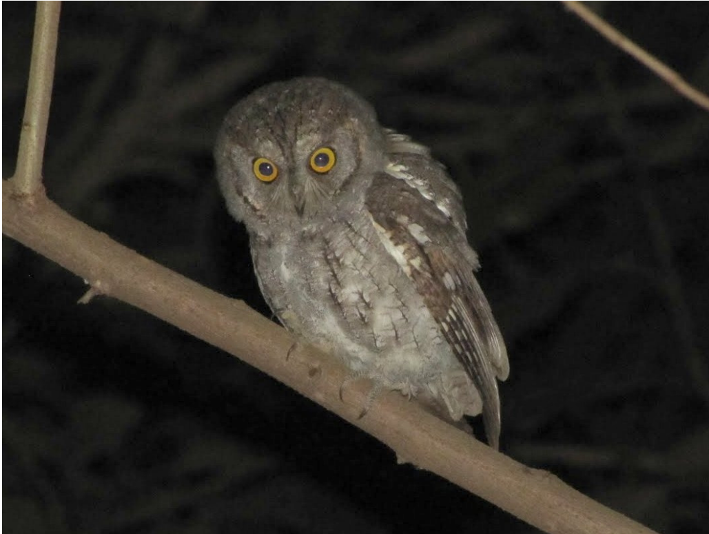
Oriental Scops-Owl at Kanha