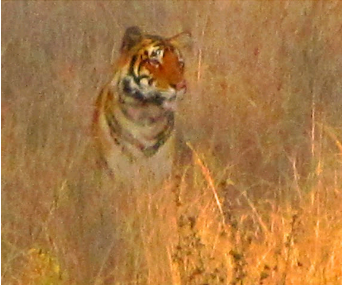
Tiger in Kanha