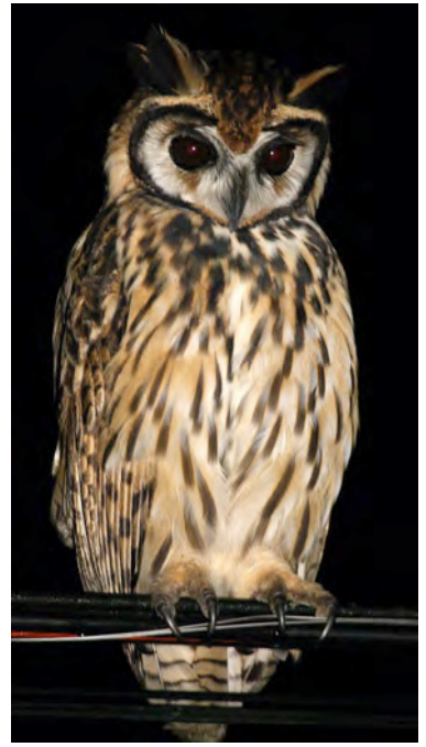
Three-wattled Bellbird, Violet Sabrewing and Striped Owl, July 2007