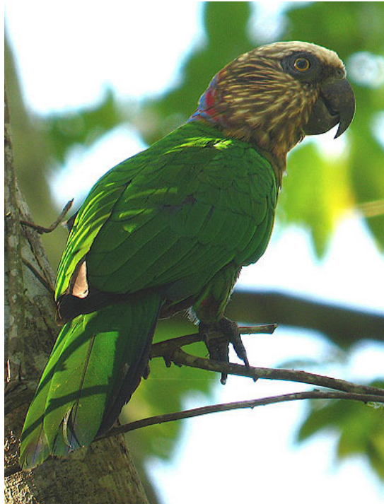
Red-fan Parrot Daptrius accipitrinus