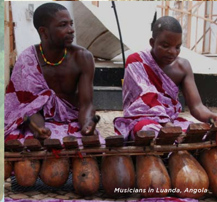
Musicians in Luanda, Angola