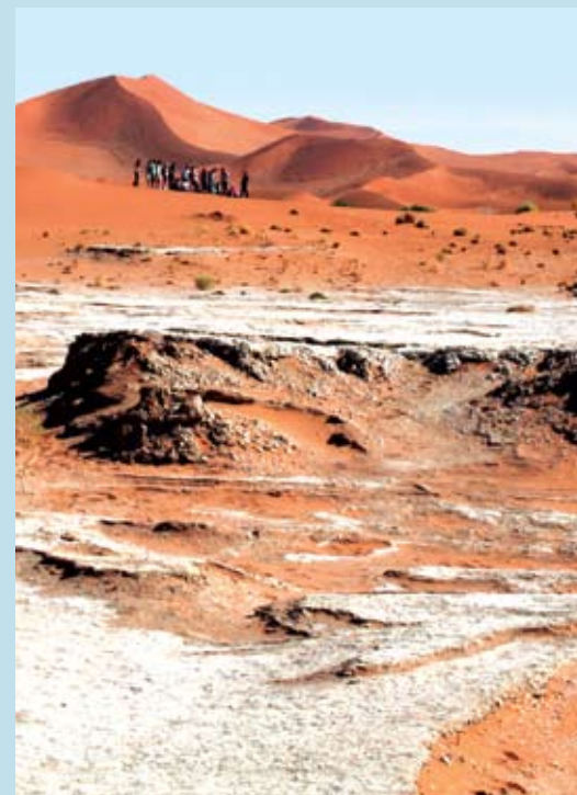
Namibia's Namib Desert Park

Tuesday, March 30 - Thursday, April 1 • LIBREVILLE • From Libreville, Gabon's capital, enjoy a choice of overnight air excursions that will reveal Gabon's biodiversity, one of the richest in West Africa. (B, L, D)