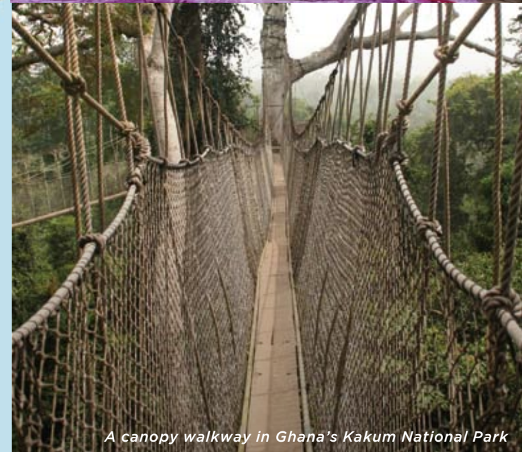
A canopy walkway in Ghana's Kakum National Park