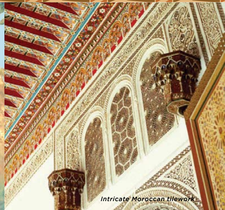
Intricate Moroccan tilework