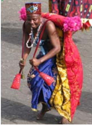
Gelede mask dance in Cotonou, Benin

PRSRT STD U.S. Postage PAID Travel Dynamics Int'l