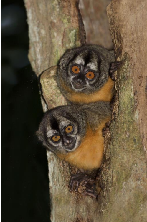
Night Monkey