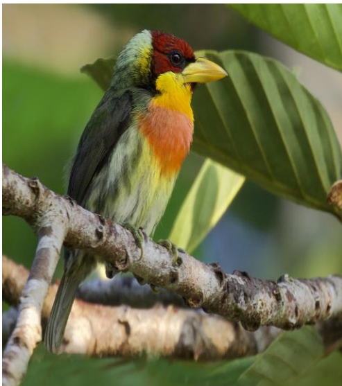
Lemon-throated Barbet

Those interested in maximizing their time in Peru are encouraged to join our optional pre- and post-cruise extensions. Our Cloud Forests of Northern Peru Pre-trip offers a rare opportunity to explore a cloud forest preserve in the northern Andes, seeking a range of rarely seen birds, especially the near-mythical Long-whiskered Owlet and Marvelous Spatuletail hummingbird. Our Machu Picchu Extension visits the incomparable ancient capital of the Inca in addition to seeking many of the special birds of the Peruvian Andes in the regions of Cuzco and the Urubamba River Valley.