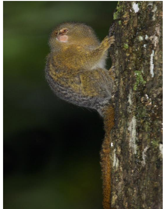
Pygmy Marmoset

February 17-18, Days 10-11: Lima to home. Generally flights depart for the USA after 10:30 p.m. on Day 10 arriving in the USA early the following morning. Those wishing to avoid the long overnight flight should consider spending a final night in Lima and taking an international flight the following morning (if available). Arrangements can be made through the VENT office for overnight accommodations in Lima at an additional charge.