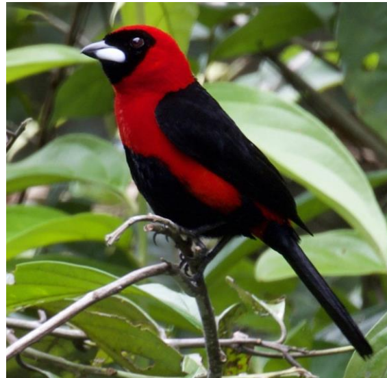
Masked Crimson Tanager

Some of the spectacular species and memorable moments may include a brilliant blue Plum-throated Cotinga perched in a treetop, a pair of Blue-and-yellow Macaws winging overhead, a swirling group of White-winged Parakeets along the river, or a White-eared Jacamar in the morning sun—it is hard to predict which of these or many other experiences will delight you the most. We'll also fill some spare shipboard time with discussions and explanations of Amazonian natural history, as well as recaps of daily excursions in the evenings. We are confident that at the end of this extraordinary cruise you will have a greater appreciation and understanding of the Amazon region and the myriad creatures that make it the most complex ecosystem anywhere on earth.