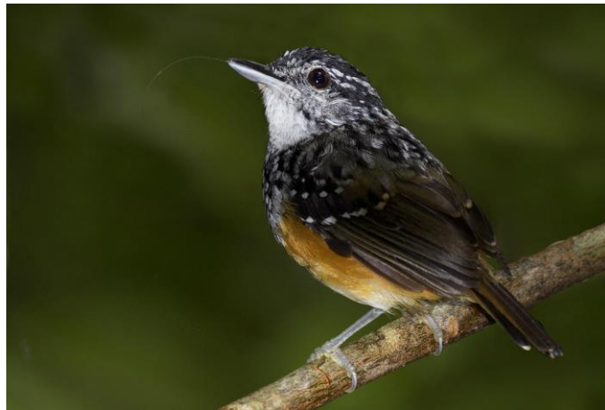
Peruvian Warbling-Antbird

We will be off the ship early for exploration of river island and várzea (floodplain) habitat, most likely in the vicinity of the Quebrada Yarapa, which is near the junction of the Ríos Ucayali and Marañon. A sampling of birds this morning could include most of the species mentioned yesterday as well as Wood Stork; Gray-headed and Snail kites; Black-collared and Slate-colored hawks; Pale-vented Pigeon; Dusky-headed, White-eyed, and Cobalt-winged parakeets; Greater Ani; Black-tailed Trogon; Green Kingfisher; Black-fronted Nunbird; White-eared Jacamar; Chestnut-eared Araçari; Crimson-crested Woodpecker; Pale-legged Hornero; Striped and Straight-billed woodcreepers; Barred Antshrike; White-headed Marsh-Tyrant; Short-crested Flycatcher; Masked Tityra; Bare-necked Fruitcrow; Black-capped Donacobius; Buff-breasted Wren; Black-billed Thrush; Red-eyed Vireo; Hooded and Turquoise tanagers; Thick-billed and Purple-throated euphonias; Silver-beaked and Masked Crimson tanagers; Yellow-rumped Cacique; and Russet-backed Oropendola. There is also a good possibility of seeing Pink River Dolphins and perhaps even Gray River Dolphins.